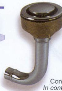
Sinistro 90° - Portagomma Ø16 Left 90° - Hose Ø16