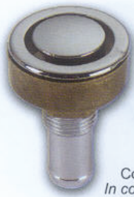
Conformi a norma R.I.N.A. In conformity with R.I.N.A. rules