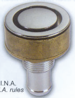
Conformi a norma R.I.N.A. In conformity with R.I.N.A. rules