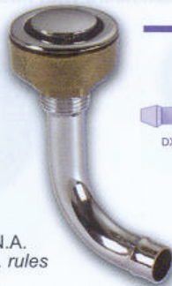
Destro a 90° - Portagomma Ø16 Right 90° - Hose Ø16